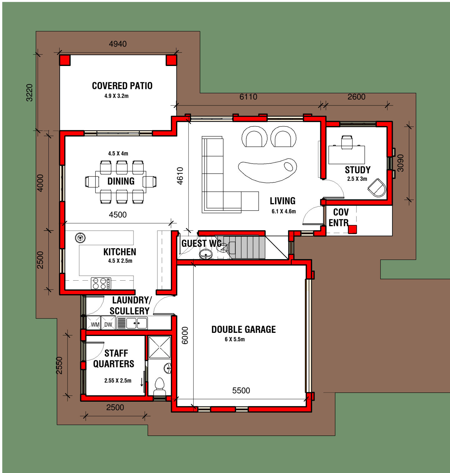
GROUND FLOOR PLAN 1 : 100